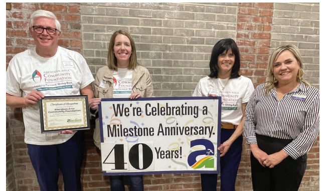
The Aberdeen Area Chamber of Commerce helped celebrate AACF's 40th anniversary.