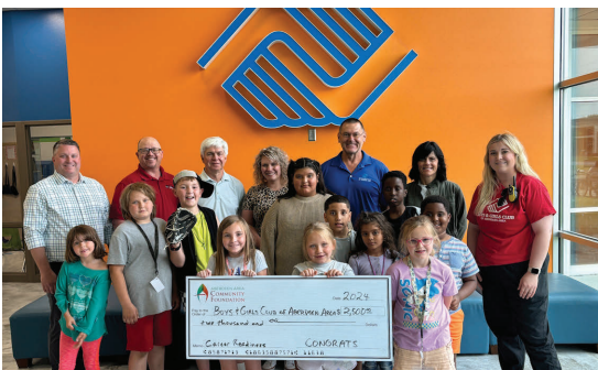
Top: Fallout Creative Community received an AACF grant for a movie studio. Middle: The Aberdeen Gymnastics Association purchased equipment with an AACF grant. Bottom left: AACF supported a Boys & Girls Club career exploration program for youth.