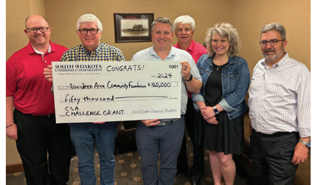
The AACF received a $50,000 challenge grant from South Dakota Community Foundation for raising $400,000 for its endowment.

AACF was established in 1984. Over time, it has made more than $300,000 in grants to the community, more than a third of that total since 2020. With its endowed funds invested in SDCF, AACF can use a portion of its assets for grants every year. With the near doubling of its assets in the past couple years, AACF's grantmaking will nearly double as well.